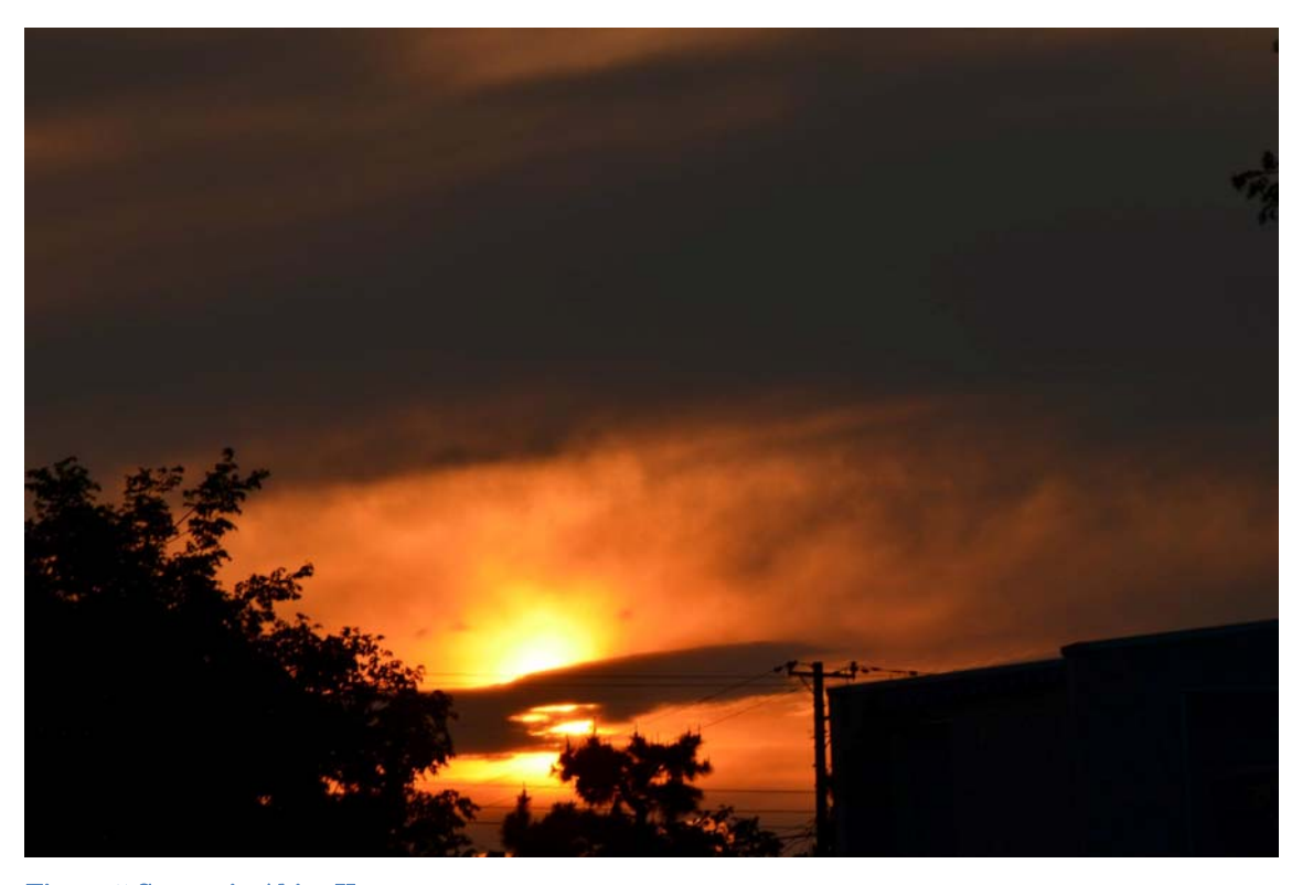
Figure 5 Sunset in Akita Kosen