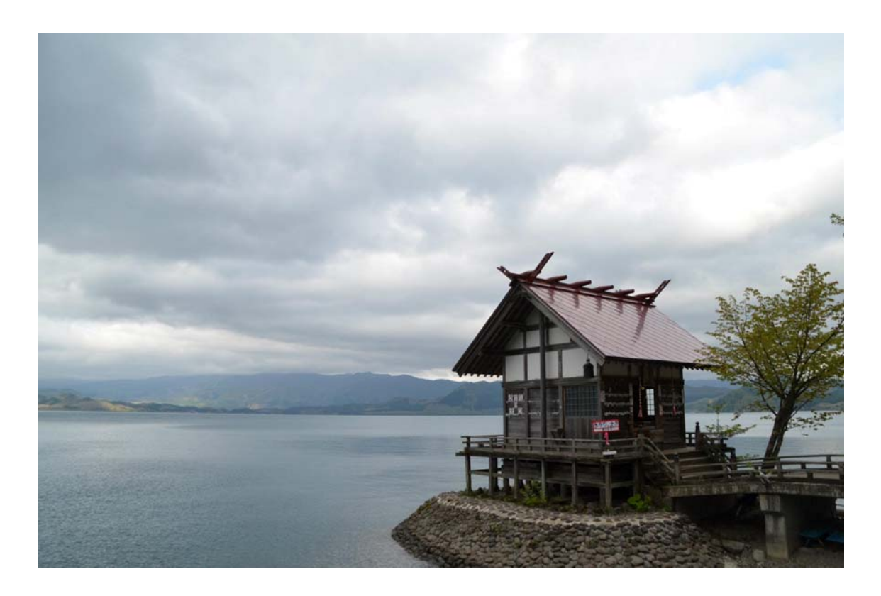
Figure 2 Lake Tazawa